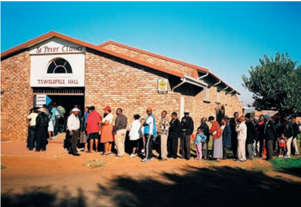
Voters queue for the April 2004 elections in Pimville, Soweto.

Review of African Political Economy . This will be published as a special issue of the journal in May 2004.