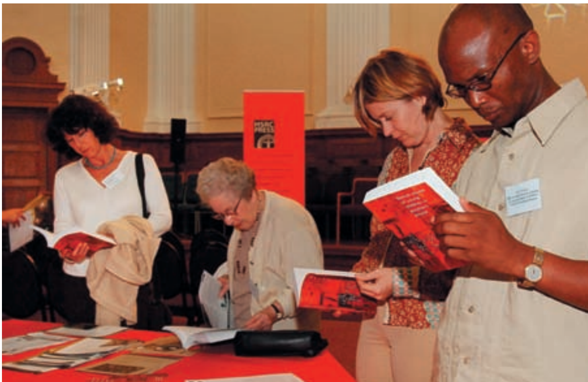
Guests at the launch of the publication Sexual abuse of young children in southern Africa .

ments on selected titles with publishers ranging from established academic houses, such as Cambridge University Press, to specialist social science publishers, such as the Nordic Africa Institute.