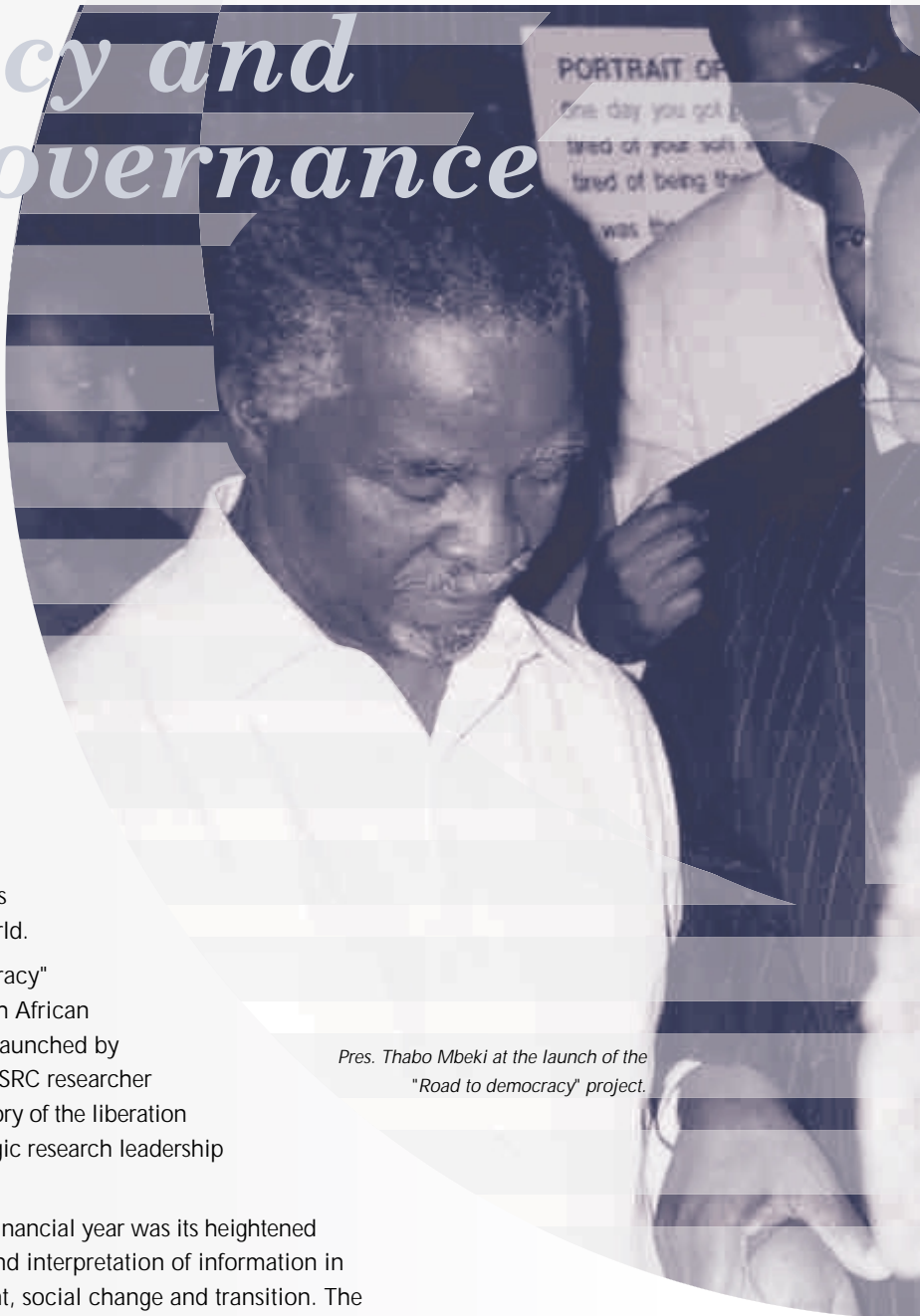
Pres. Thabo Mbeki at the launch of the "Road to democracy" project.

The major impact of the NPA during the 2000/01 financial year was its heightened visibility as a leading role player in the analysis and interpretation of information in the fields of political and economic empowerment, social change and transition. The NPA's work assisted decision making at all levels, and also helped forge partnerships and networks with local experts and international associates from the USA, India, Canada and France. In turn, these research outputs and networks enabled the HSRC to access local and international funders and to participate more widely at international conferences.