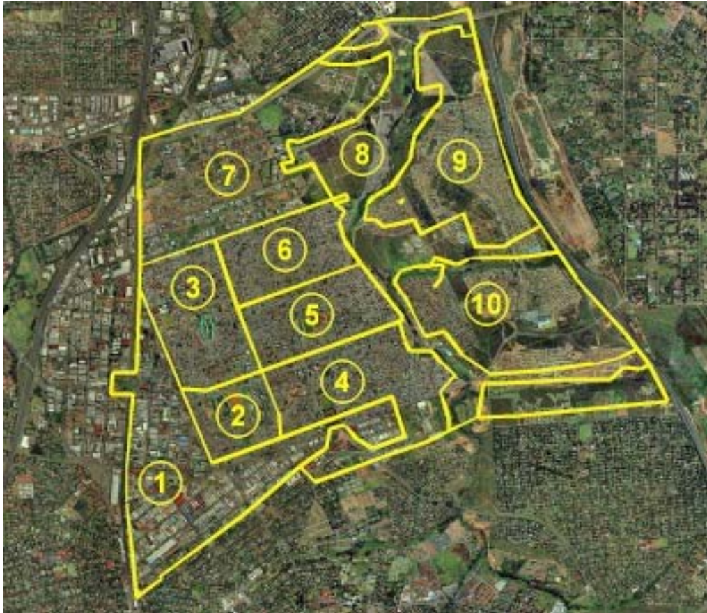
Figure 2. Greater Alexandra and its Precincts