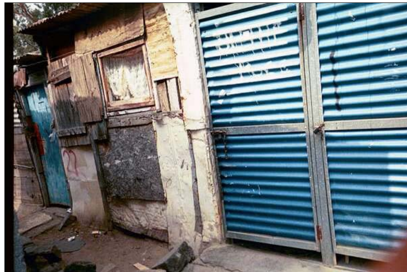
Figure 3: Informal housing Alexandra

The ADF meets regularly. The main role of ADF according to the Deputy Chairperson is for the ADF to be a watchdog of the ARP, e.g. "to keep an eye on tender and procurement issues." In addition, the Deputy Chairperson maintains that all development projects planned must first go through the ADF for approval. 29