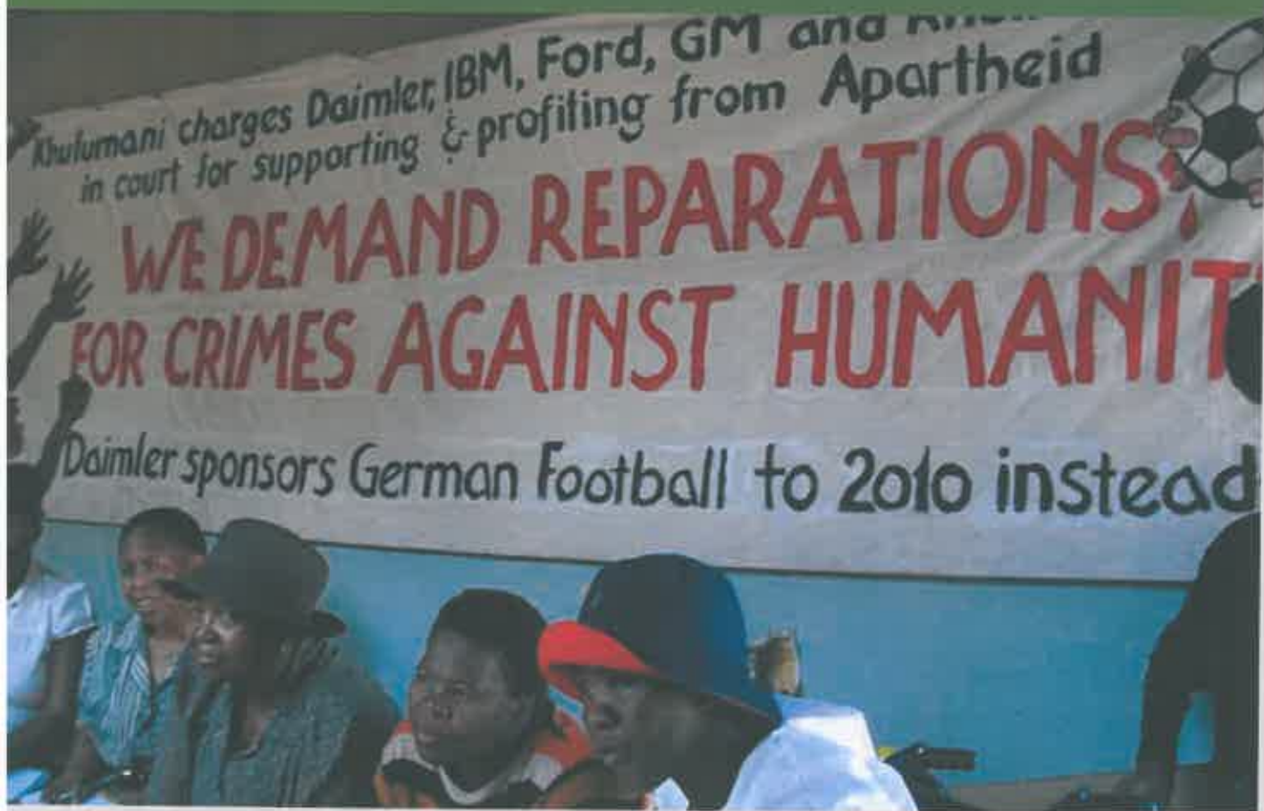
The photograph was taken at the launch of the book – All That Was Lost, Apartheid Violence: Third TRC participants speak – Edited by Catherine C. Byrne, 2010.

The basis of the claim is that large corporations aided and abetted the National Party government in keeping the apartheid machinery running smoothly