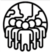
National/Ethnic/ Social Origin