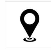
Location/ Physical Address