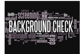
Educational/Medical /Financial/ Criminal or Employment History