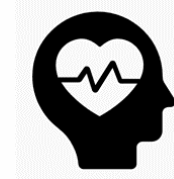
Physical/ Mental Health