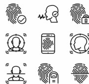
Photos/Video Footage Voice Recordings/Biometrics